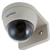
CD-WMI200 (Ivory) Indoor Wall Mount