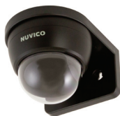
CD-WMB200 (Black) Indoor Wall Mount